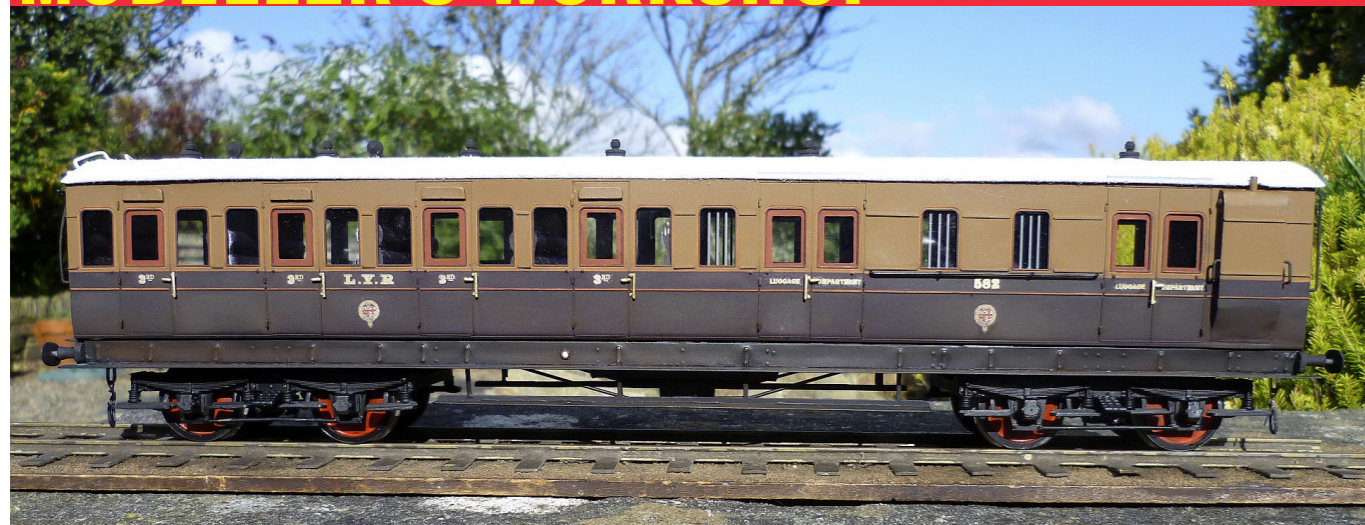
Diagram 30 Brake Third