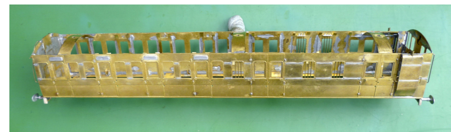
The assembled carriage sides and ends.

I added two additional steps to the carriage end, one at each corner (to continue the sequence of the steps