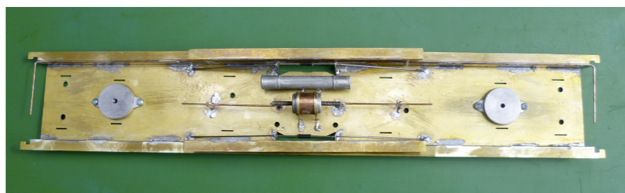
The carriage underframe.

I held the steps down gently in a vice; put a blob of low melt solder on the underside of the step, noting that this has to be offset on Nos.1 and 3 in order to be able to solder the step support to the space on the bogie. The brass strip is melted into this blob. (I use an 18 watt soldering iron). Be quick and brave! The